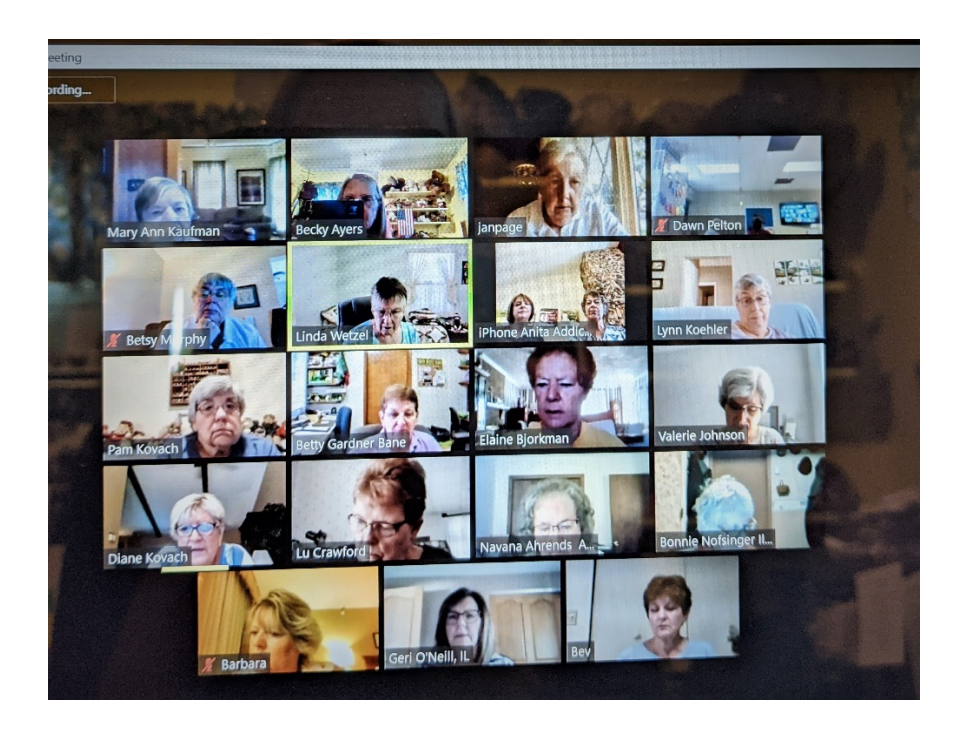
September Board Meeting