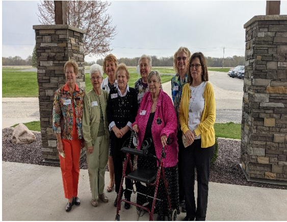
Past IL Presidents