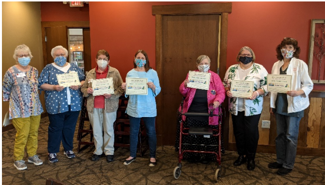
Membership Awards at Central District