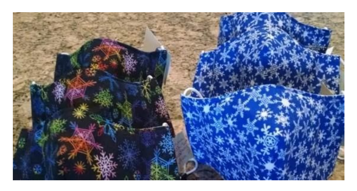
I will include some pictures... Thank you for your interest...Toni Redlingshafer