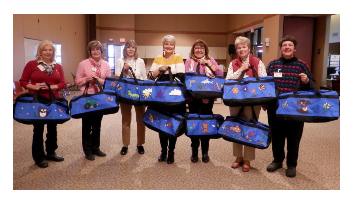
Alpha Chapter gathered together to decorate and fill Sweet Cases that were later delivered. Thanks!

The Membership Campaign has been extended. The end date is May 29, 2020. Some chapters have been initiating new members by phone and by utilizing technology.